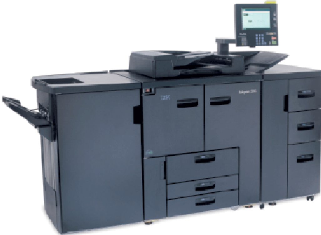
Figure 25. Infoprint 2105 Printer

Table 128 summarizes the printer characteristics for the Infoprint 2105 printer.