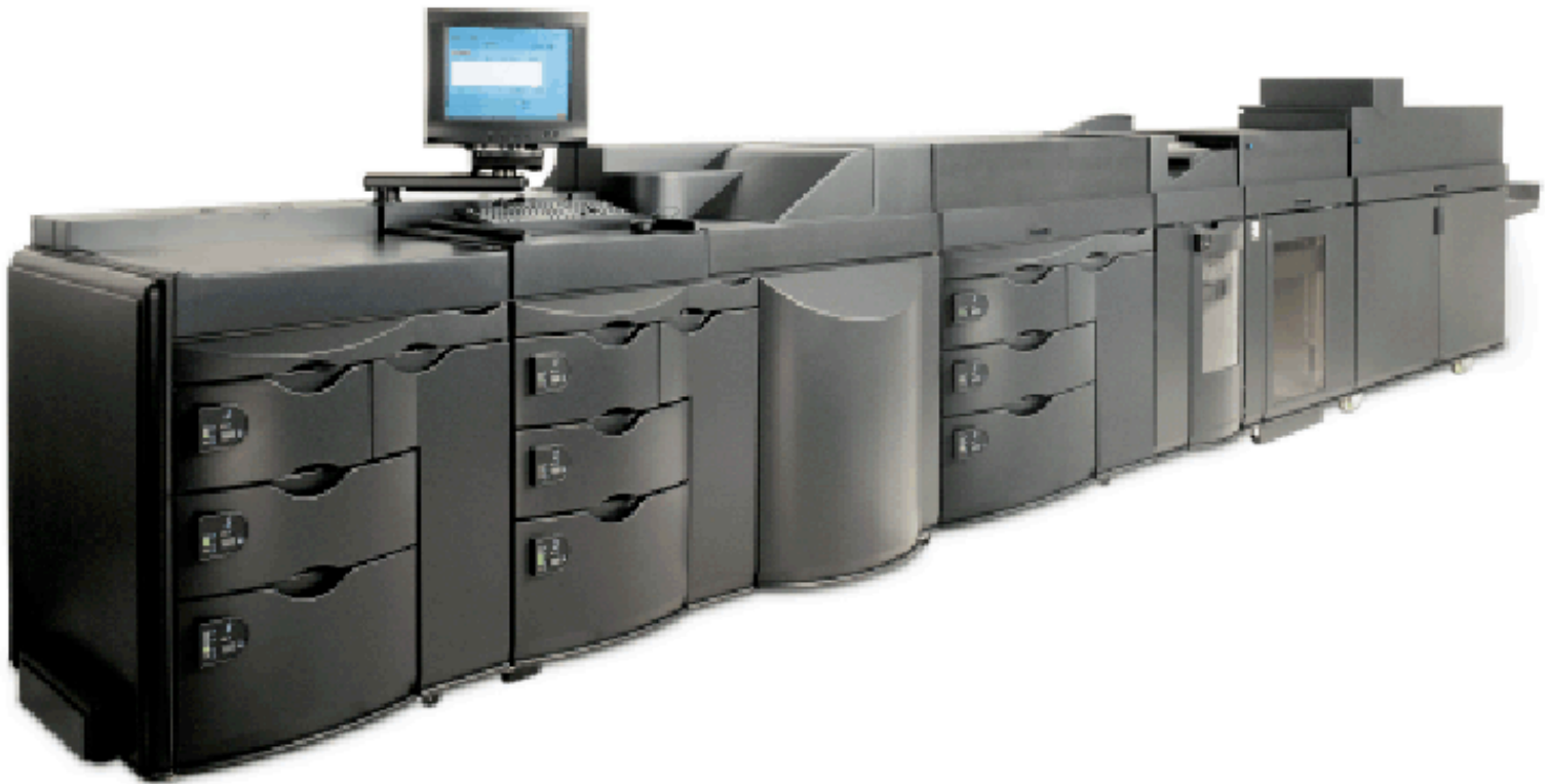
Figure 29. Infoprint 2000-AF1 Printer

Table 131 summarizes the printer characteristics for the Infoprint 2000-AF1 printer.