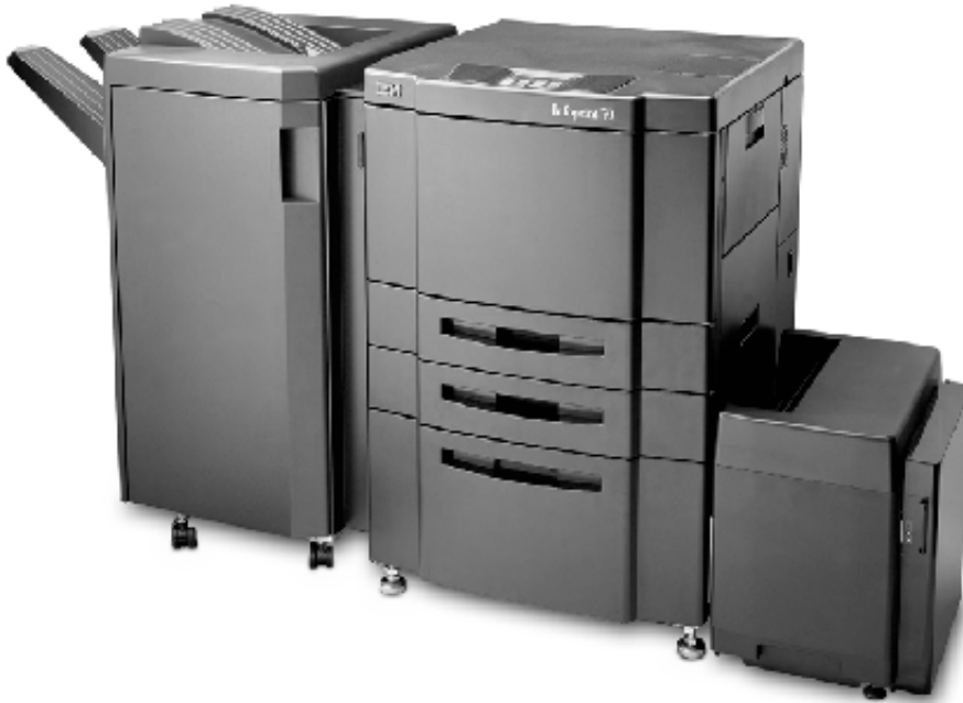
Figure 21. Infoprint 70 Plus printer

Table 124 summarizes the printer characteristics for the Infoprint 70 plus printer.