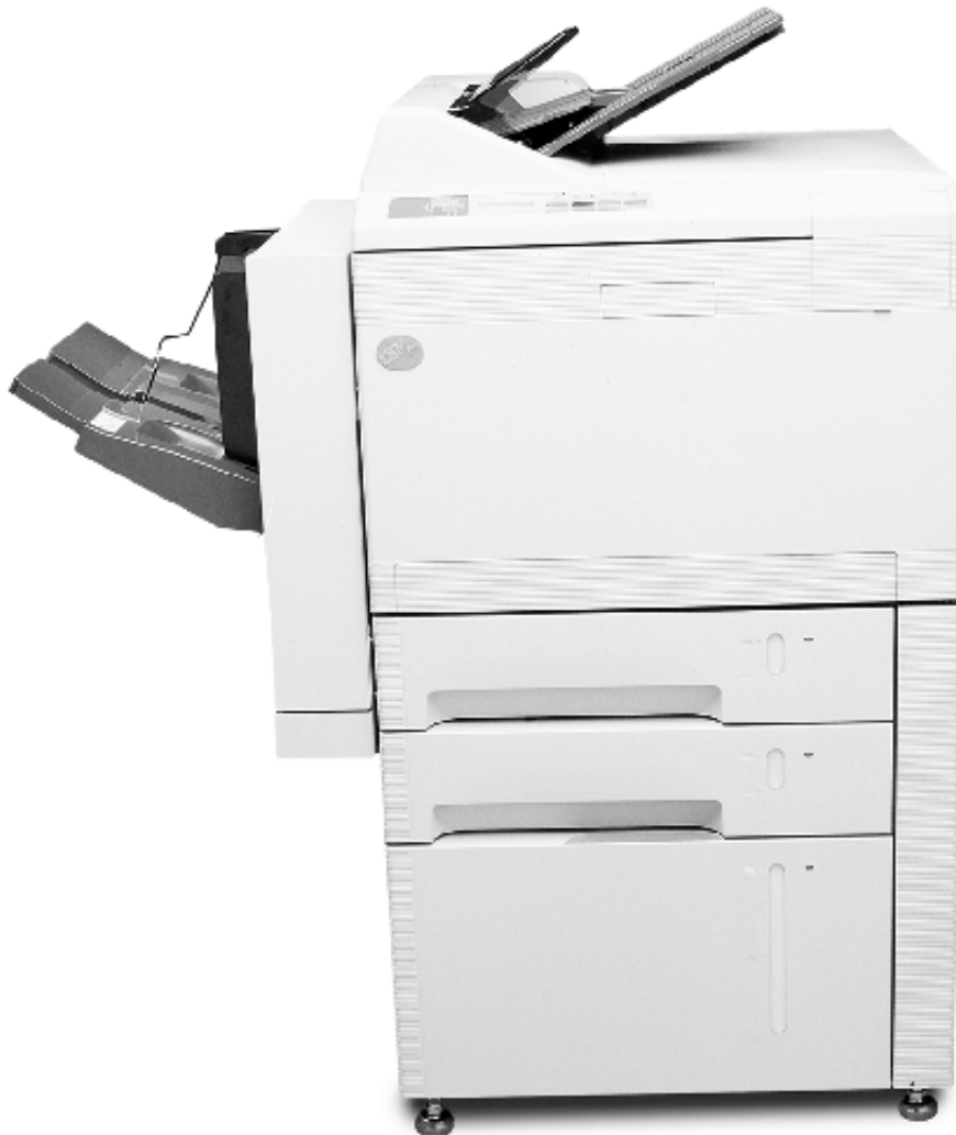
Figure 77. Infoprint 60 Printer

Table 217 summarizes the printer characteristics for the Infoprint 60 printer.