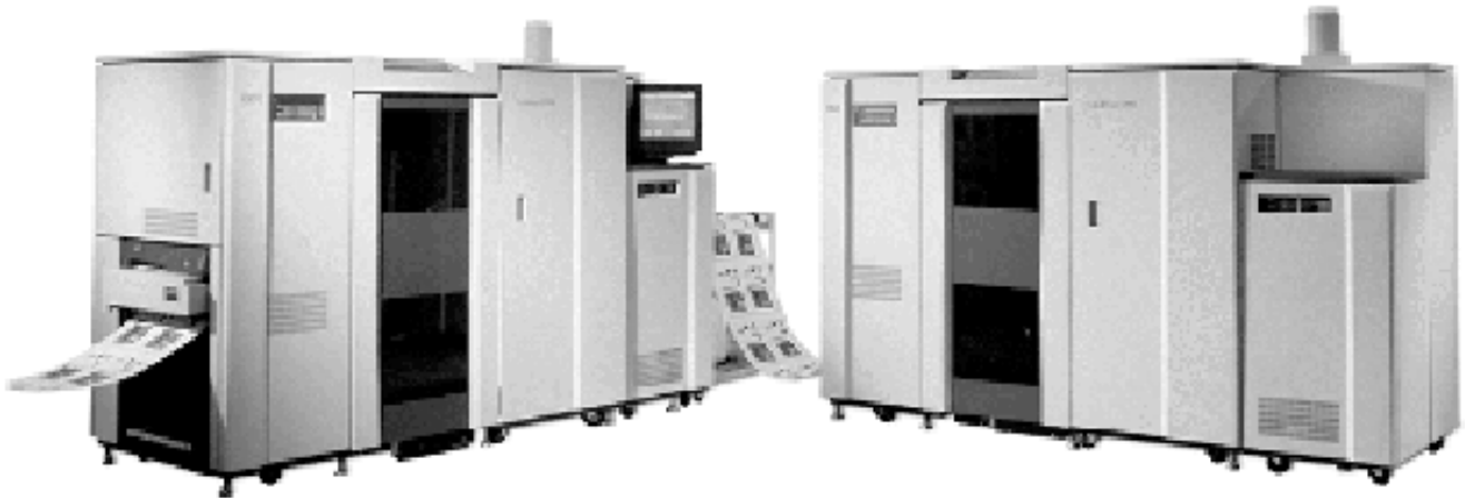
Figure 37. Infoprint 4000-ID1/ID2 and 4000-ID3/ID4 Printers

Table 135 summarizes the printer characteristics for the Infoprint 4000-ID1/ID2 and 4000-ID3/ID4 printers.