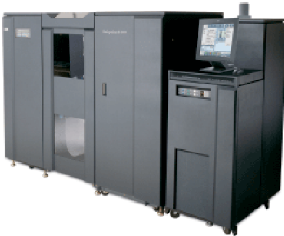
Figure 43. Infoprint 4100-HS2 Printer

Table 138 summarizes the printer characteristics for the Infoprint 4100-HS2 printer.